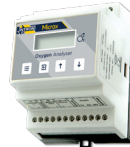
Microx Oxygen Analyser