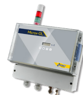
Microx-OL Online Oxygen Analyser