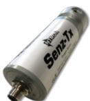
SENZTX Oxygen Transmitter