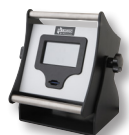
GazTrak Portable oxygen & moisture measurement